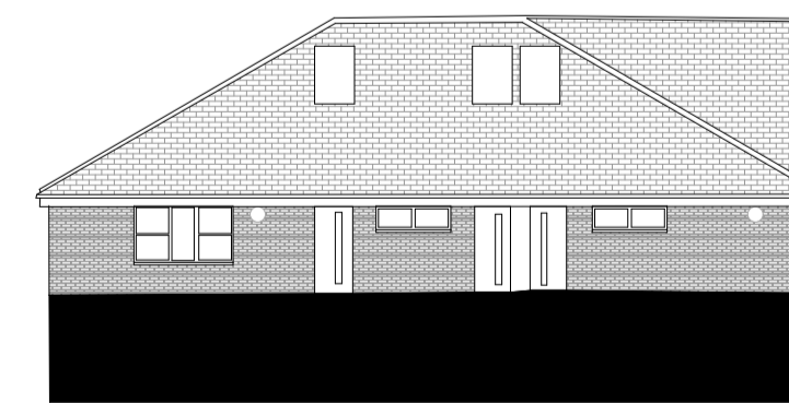
North Elevation 03