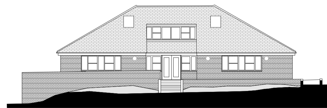
East Elevation 02